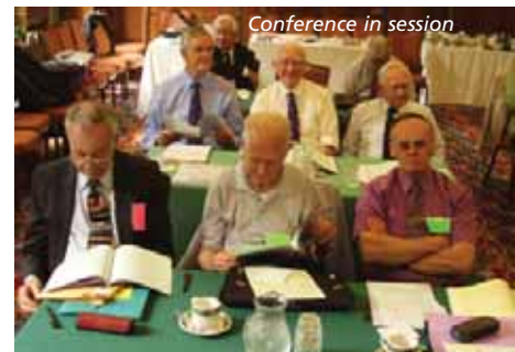
Conference in session

In last sentence delete all after “promote” and insert “to engineering employers the advantages in using ECUK Registered professional engineers.”